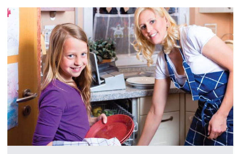
Want a list of age-appropriate jobs that your kids can do? Get a great 'Kids' Chores & Responsibilities Guide' with practical tips about how to get kids to help when you subscribe to Happy Kids, my FREE email parenting guide, at www.parentingideas.com.au/ParentingIdeas-Newsletter

In the meantime, if the definition of 'strict' has changed then I urge you to be strict! Your kids will thank you ... later on, when you've equipped them with the problem-solving and independence skills needed to negotiate the wider world without you.