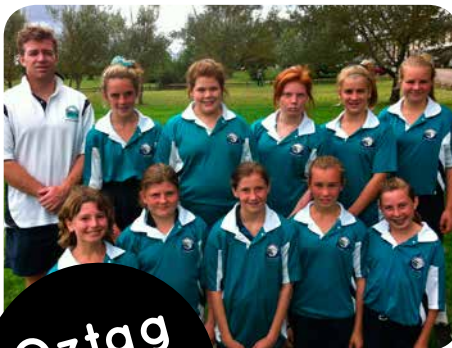
Oztag & Touch